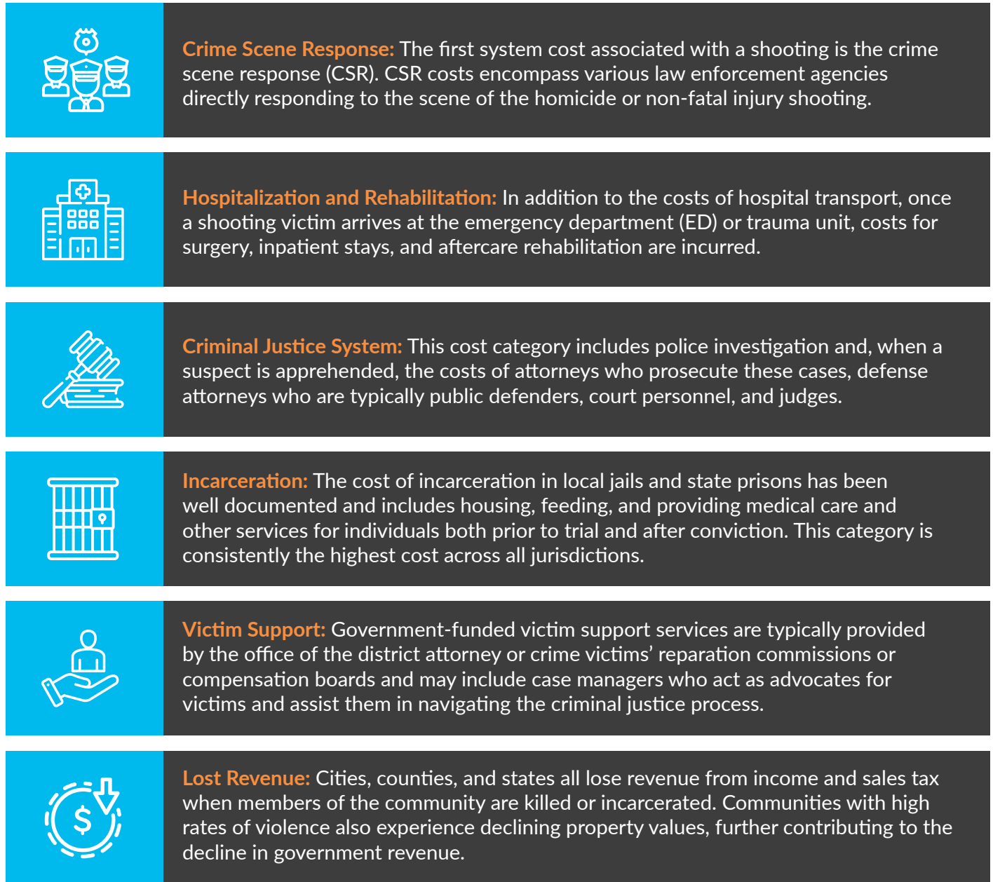
Table 1 shows the unit and average cost for each of these six categories. The methodology for each cost category calculation is explained in detail in the remainder of this report.

For this report, as with the city-level reports shown above, NICJR has quantified the cost of gun violence in six primary cost categories: